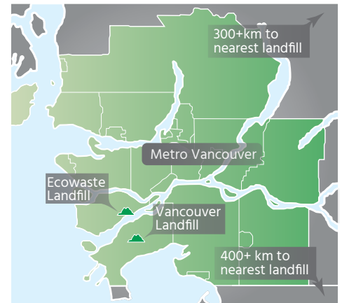
If the Ecowaste or Vancouver landfills reach capacity, construction and disposal waste will need to be shipped out of Metro Vancouver to central BC or the US.

We can't address this issue on our own and are looking for the support of government stakeholders that include the BC Ministry of Environment; the Ministry of Agriculture, Food and Fisheries; the ALC; the City of Richmond; Metro Vancouver Solid Waste Services; and Climate Change Strategy.