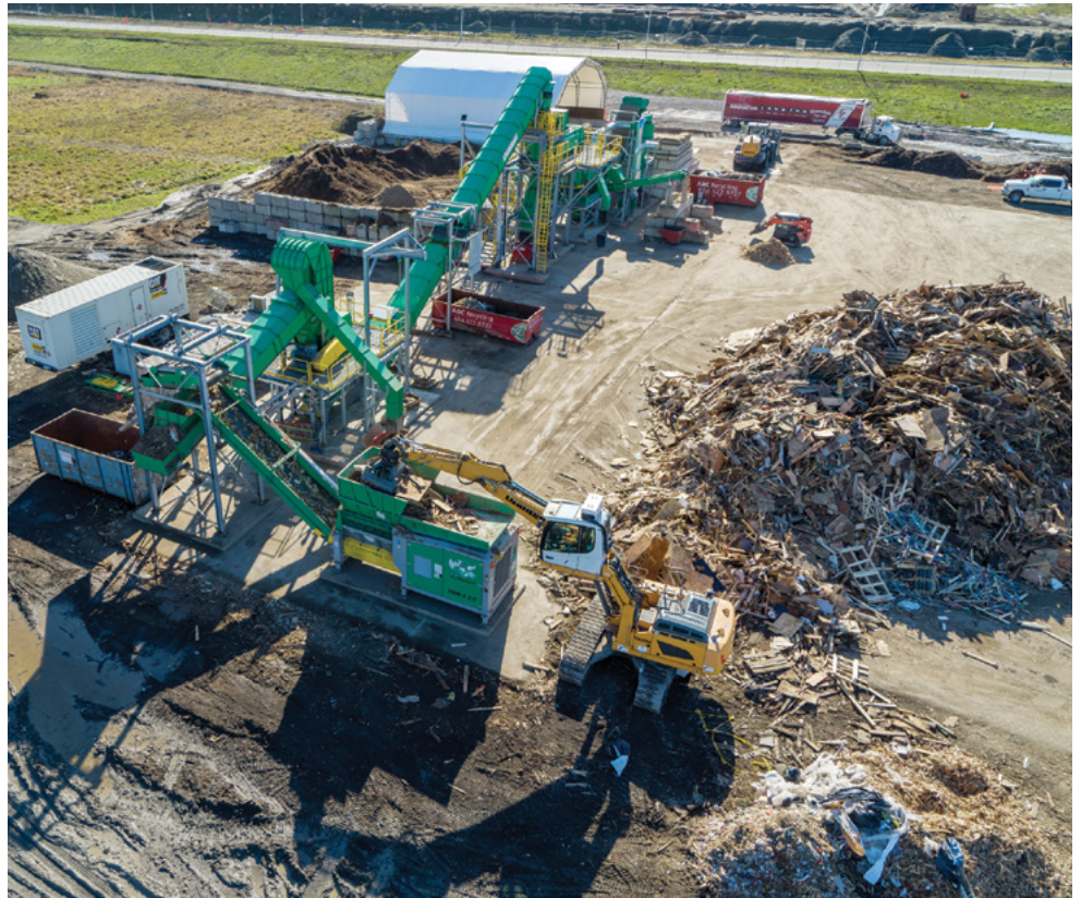
In 2019, we recycled 30% of the material received at our landfill.